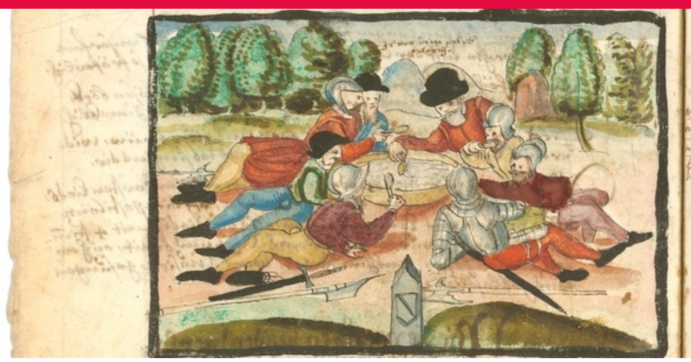
© Zentralbibliothek Zürich, Ms. B 316, fol. 418v.